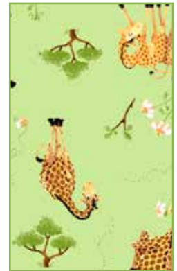
3/4 yd for pillowcase body