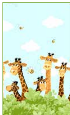
3/4 yd for pillowcase body