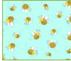
1/4 yard for cuff