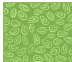
2" for flange