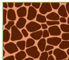
1/4 yard for cuff