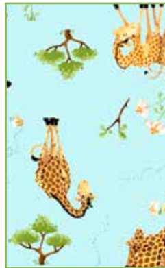
3/4 yd for pillowcase body