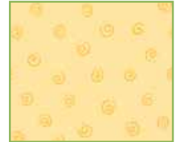
2" for flange