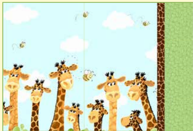
Standard Size Pillowcase

Includes complete instructions and link to a detailed video tutorial.