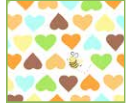
1/4 yard for cuff