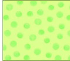
1/4 yard for cuff