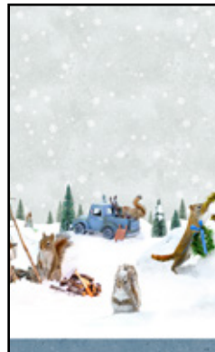
3/4 yd for pillowcase body