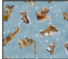
1/4 yard for cuff