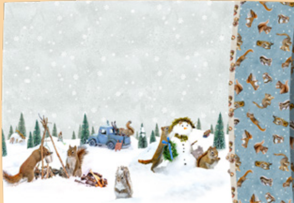
Standard Size Pillowcase

Includes complete instructions and link to a detailed video tutorial.