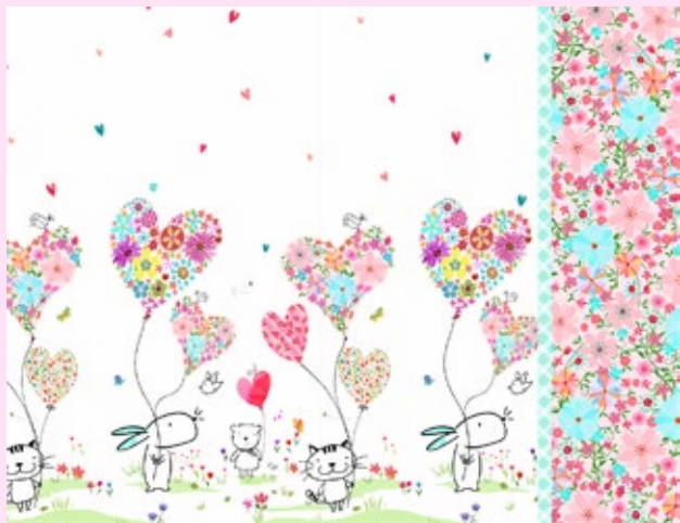
Standard Size Pillowcase

Includes complete instructions and link to a detailed video tutorial.