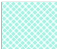
2" for flange