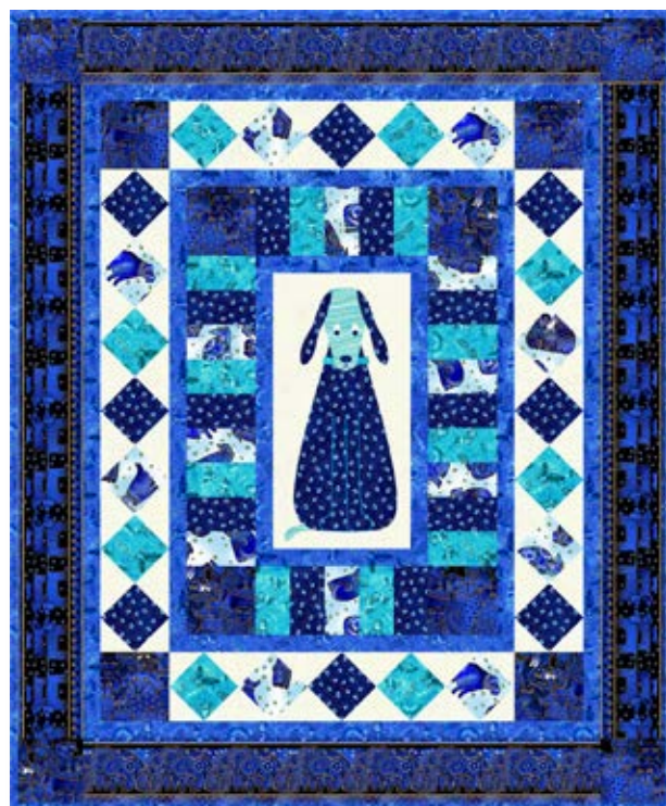
Dog Applique shown, 38" x 46"

Fabrics C & G combined length = 1 yds (extra for fussy cutting)