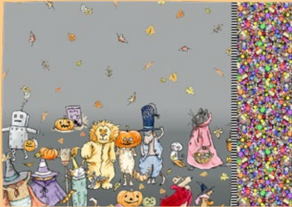
Standard Size Pillowcase

Includes complete instructions and link to a detailed video tutorial.