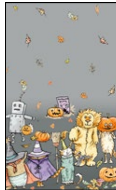
3/4 yd for pillowcase body