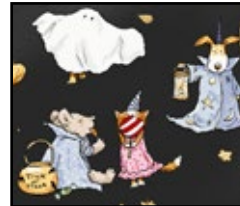
1/4 yard for cuff