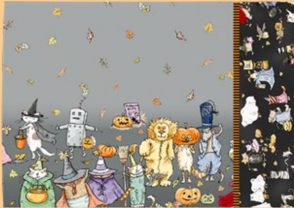
Standard Size Pillowcase

Includes complete instructions and link to a detailed video tutorial.