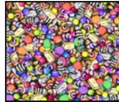
1/4 yard for cuff