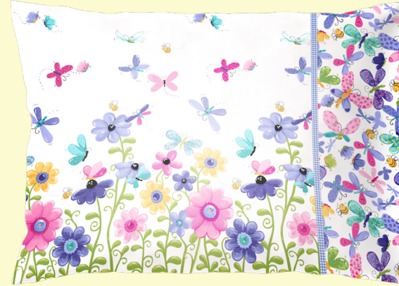
Standard Size Pillowcase

Includes complete instructions and link to a detailed video tutorial.