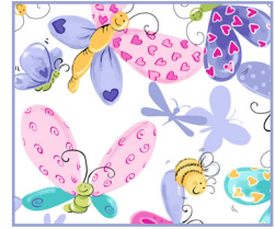
1/4 yard for cuff