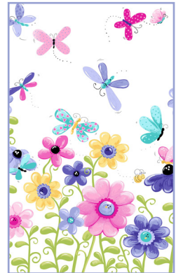
3/4 yd for pillowcase body